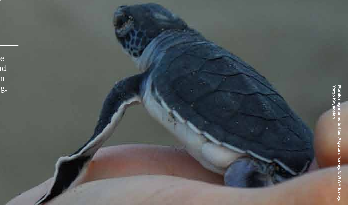
Monitoring marine turtles, Ayatan, Turkey.

WWF strives to find innovative ideas to scale-up conservation in the Mediterranean. This entails new partnerships, biodiversity financing solutions, engaging with key industries (tourism, maritime traffic) and developing targeted campaigns to mobilize people and constituencies.